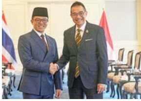
Indonesian Foreign Minister Sugiono (L) with Thailand's Foreign Minister Maris Sangliampongsa during their meeting in Bangkok, Thailand