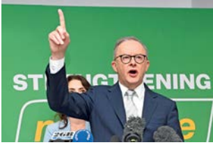
Australian Prime Minister Anthony Albanese speaks during a visit to Morayfield Medicare Urgent Care Clinic near Brisbane