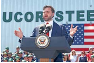
Vice President JD Vance speaks during a tour at Nucor Steel Berkeley in Huger, Unincorporated community in South Carolina