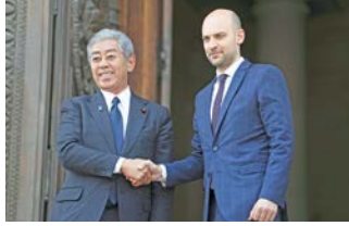
French Foreign Minister Jean-Noel Barrot (R), welcomes his Japanese counterpart Takeshi Iwaya, Japan