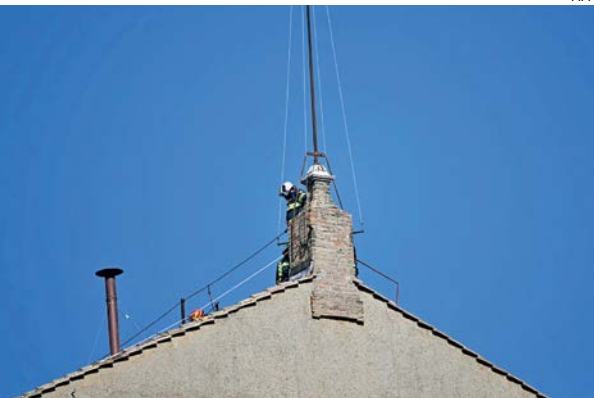
A view of the chimney (L) on the roof of the Sistine Chapel as it is being installed in The Vatican

Cardinals from around the world have been called back to Rome following the