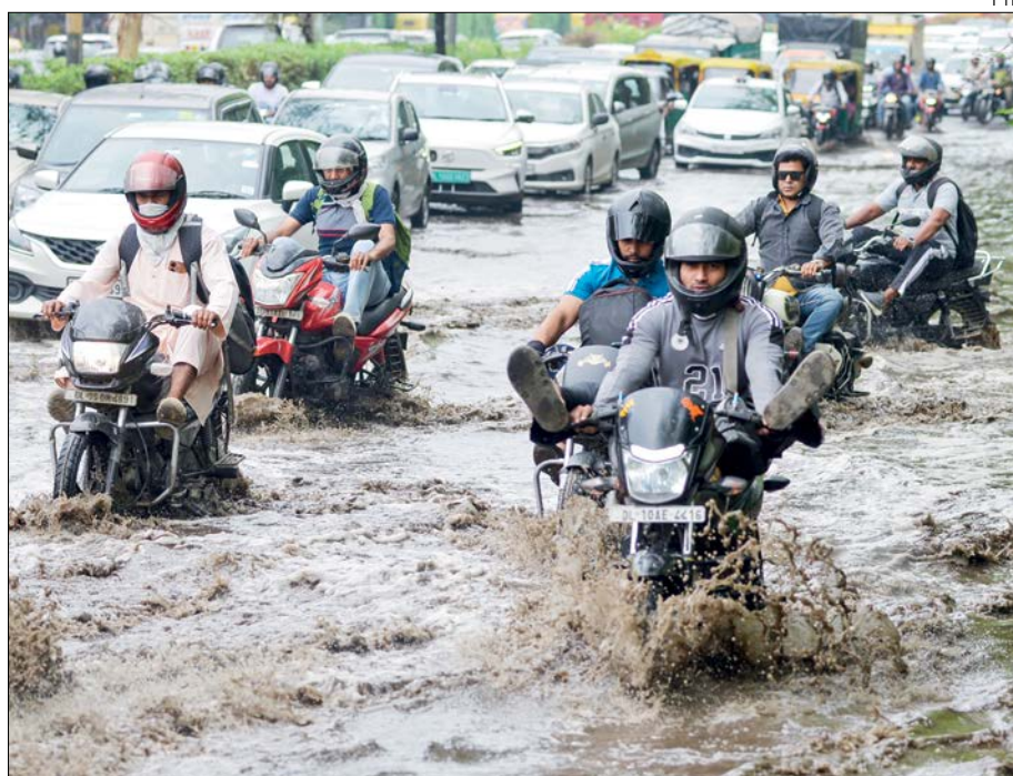
Vehicles move on a waterlogged road after heavy rainfall, at ITO, in New Delhi, on Friday