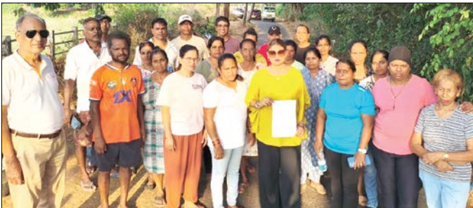
Residents of Navelim gather near the Tolleabandh ground to demand better policing after sunset