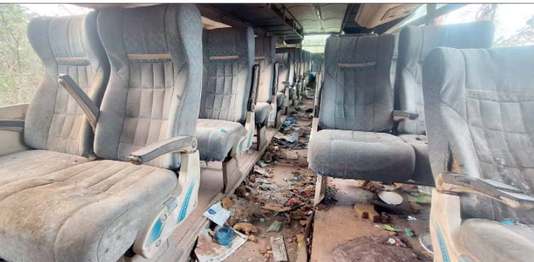
A derelict bus parked at the Interstate Bus Stand in Patto, Panjim, has become a hotspot for drunkards and drug users. Strewn with broken liquor bottles, snack wrappers, and cigarette butts, the filthy vehicle tells tales of countless late-night binges. Locals say women passengers feel especially unsafe walking past the bus after dark, yet the authorities have failed to act