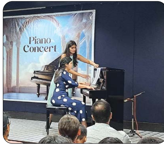
AN EVENING AMIDST THE BUDDING PIANISTS OF MARGAO