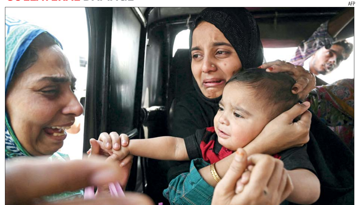
A Pakistani citizen (c) bids goodbye to her son, an Indian citizen, as she prepares to return to her country through the India-Pakistan Wagah border post, about 35kms from Amritsar, on Tuesday