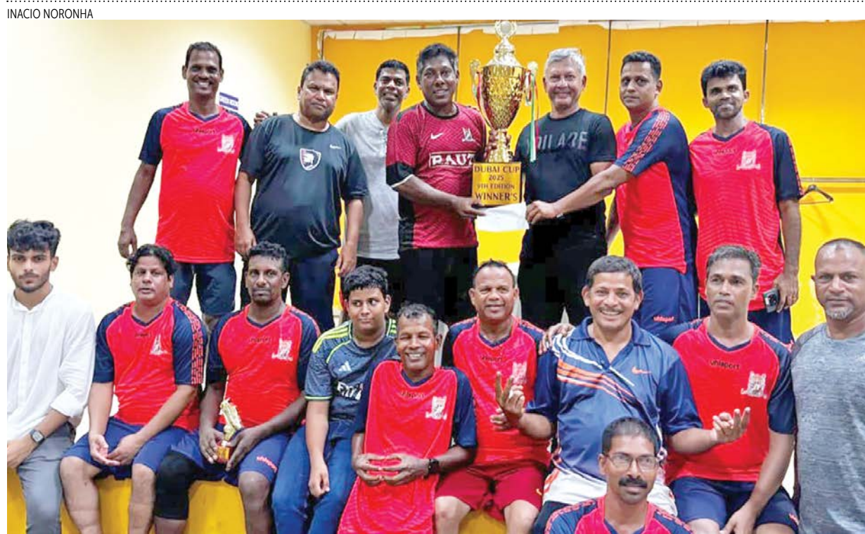
Vasco Veterans emerged football champions in the Dubai Cup, recently. In the final, Vasco Veterans scored a hard-fought 4-3 victory via tie-breaker over Fatorda Sada Boys