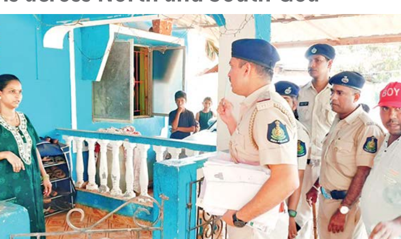
Police conduct a tenant verification drive at Anjuna

Bungalow nr Nagesh Garden SDPO Pernem Ashish above old Hospicio Hospital Alto Monte, MARGAO. 10,000m2 PLOT near Marrie Fairfield, walking distance from beach at BENAULIM. rties Kindly Contact (Brokers Excu SANDESH DA JI SINAI KUNDAIKEE Call - 9225902518 Whatsapp Only- 9225985518 sandeshkundaiker@rediffmail.com