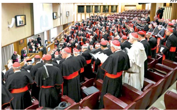
Cardinals during the fifth congregation meeting in The Vatican

most pressing Church challenges including "evangelisation, the relationship with other faiths (and) the issue of abuse", the Vatican said.