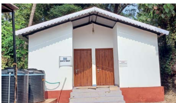
A permanent toilet within the UNESCO World Heritage Site in clear violation of the rules

Reports suggest there are now over 70 illegal structures within the protected