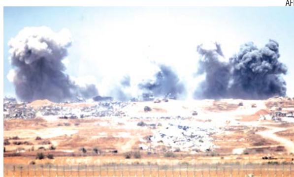
Gaza Strip shows smoke plumes rising following explosions inside the Palestinian territory

AP, DEIR AL-BALAH: Hospitals in the Gaza Strip received the remains of 51 Palestinians killed in Israeli airstrikes in the past 24 hours, the local Health Ministry said Sunday, bringing the Palestinian death toll from the 18-month-old Israel-Hamas war to 52,243. Israel ended its ceasefire with Hamas by launching a surprise bombardment on March 18, and has been carrying out daily waves of strikes. Ground forces have expanded a buffer zone and encircled the southern city of Rafah, and now control around 50 per cent of the territory.