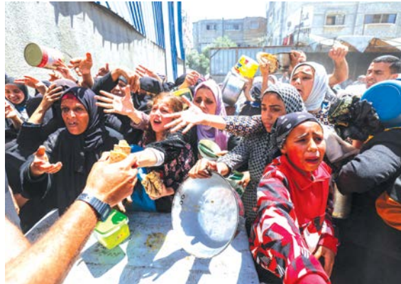
Palestinians queue for a hot meal at a charity kitchen run by the United Nations World Food Programme (WFP) at the Nuseirat refugee camp in the central Gaza Strip