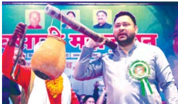
RJD leader Tejashwi Yadav during 'Tari Vyavsay Mahajutan' programme, in Patna, Bihar