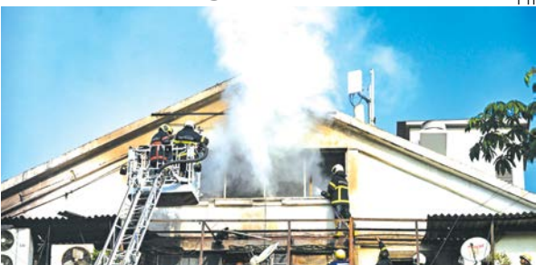
Firefighters douse a fire which broke out at the ED office building in south Mumbai's Ballard Estate area, on Sunday

No one hurt; files, equipment feared damaged