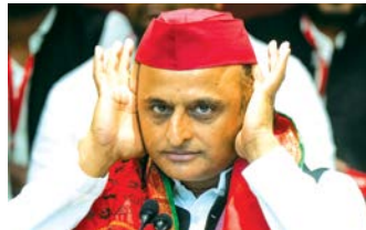
Samajwadi Party President Akhilesh Yadav during a press conference at the party office, in Lucknow