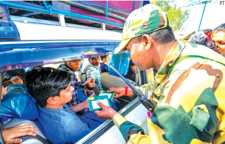
A security personnel checks the passports of Pakistani nationals as they arrive at the Attari-Wagah border to move to their country, near Amritsar, on Sunday

Similarly, 116 Indians, including one diplomat, returned from Pakistan on Sunday through the international land border crossing; 342 Indians, including 13 diplomats and officials, came back on April