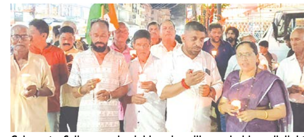
Calangute, Saligao, and neighbouring villagers hold candlelight vigil to honour victims of Pahalgam massacre

filled 'C' forms for foreigners staying at hotels, guest houses, and homestays. Additional police staff were deployed at railway stations at Karmali, Tivim, and Pernem (Malpem) as well as at the bus stands in Panjim and Mapusa to monitor suspected passengers arriving by train or inter-State bus-