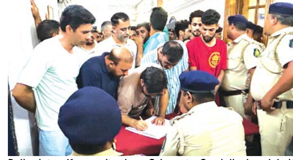
Police intensify security along Calangute-Candolim beach belt amid presence of Kashmiri-run tourism businesses