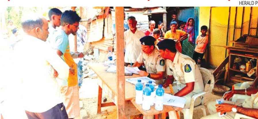
Police conduct verification of tenants and domestic servants in Arpora