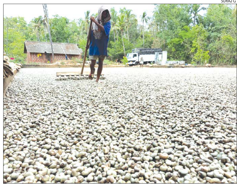
A farmhand rakes through a carpet of cashewnuts, still in their shells, put out to dry at Balli-Quepem. This year, farmers are selling raw cashews for Rs 160 per kg