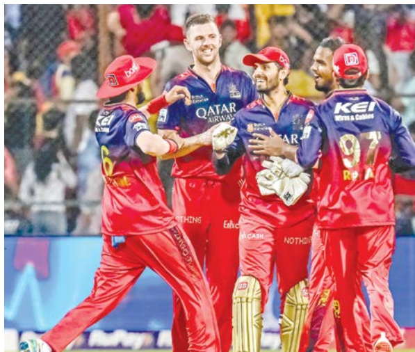
Royal Challengers Bengaluru's Josh Hazlewood (3L), along with teammates, celebrates the team's win against Rajasthan Royals at the M Chinnaswamy Stadium in Bengaluru

Suryavanshi, RR's impact player, scored 16 off 8 balls with two sixes before falling to a Bhuvneshwar Kumar knuckleball. RR raced to 72/2 in the powerplay