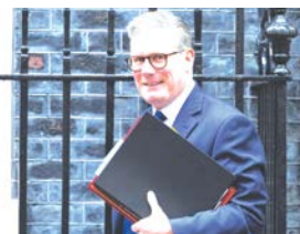
Britain's Prime Minister Keir Starmer leaves 10 Downing Street to attend the weekly Prime Ministers' Questions session in parliament in London