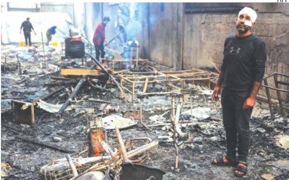
Palestinians inspect the damage after an Israeli strike on the Yafa school building, a school-turned-shelter, in Gaza City

There was no immediate Israeli comment on the strike, which set several tents ablaze, burning people alive. The military says it only