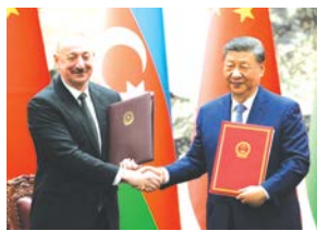
Chinese Prez Xi Jinping (R), & Azerbaijani Prez Ilham Aliyev greets during a signing ceremony at The Great Hall of The People, in Beijing, China