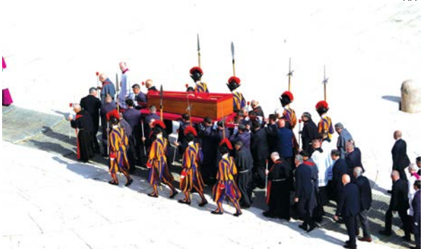
People queue in St Peter's Square to pay their respect to the late Pope Francis, who will lie in state at St. Peter's Basilica for three days, at the Vatican

Many people paying their respects had come to Rome to celebrate Easter, on a spring vacation or other personal business, only to be met with the news of Francis' death on Easter Monday. Out of devotion to the Argentine pope and his message of inclusion,