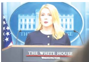
White House press secretary Karoline Leavitt speaks during a press briefing at the White House in Washington