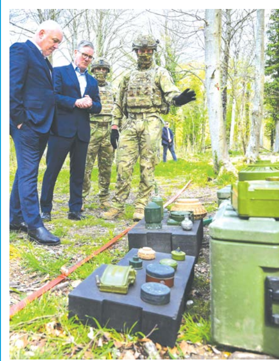
Britain's Prime Minister Keir Starmer (2L) and New Zealand's Prime Minister Christopher Luxon (L) talk with New Zealand troops involved with land mine training, during a visit to a British army base in the west of England where they saw the training of Ukrainian forces by the UK and New Zealand military as part of Operation Interflex