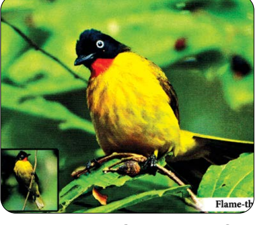
A PHILATELIC TRIBUTE TO EARTH DAY