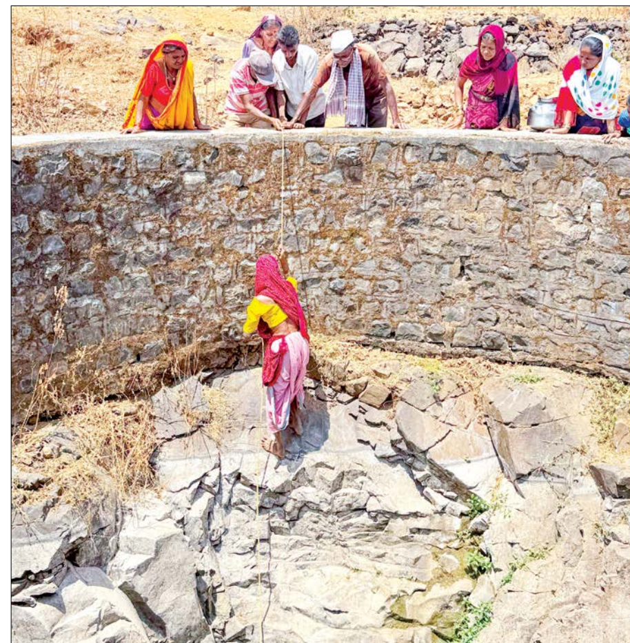
A woman climbs down a deep well using a rope to fetch water, amid the ongoing water crisis in the hot summer season, in Nashik district, Maharashtra, on Tuesday