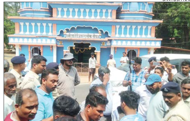
Bhoma residents confronted NH officials, who proceeded with the measurements, which led to chaos and traffic congestion