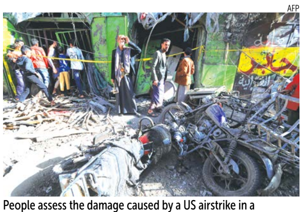
neighbourhood in the Huthi-controlled Yemeni capital Sanaa

Other raids were reported late Sunday in the central province of Marib, Hodeida in the west and the Huthi bastion of Saada in