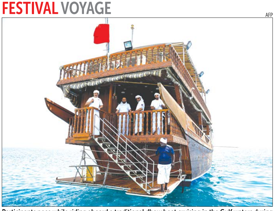
Participants pose while riding aboard a traditional dhow boat cruising in the Gulf waters during the handline fishing competition of the Senyar Festival off Sealine south of Doha

sponse to the latest deadly Huthi miltary spokesman American strikes. The Huthis also targeted Yahya Saree said the group launched attacks on two two Israeli locations with US aircraft carriers in redrones, he said.