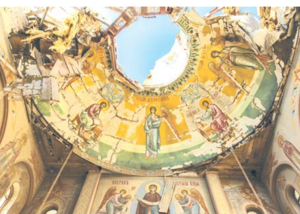
Picture shows the interior of a church heavily damaged by shelling in Kostyantynivka, eastern Donetsk region, amid the Russian invasion of Ukraine

Despite Putin's declaration of an Easter ceasefire, Zelenskyy said Sunday morning that Ukrainian forces had recorded 59 instances of Russian shelling and five assaults by units