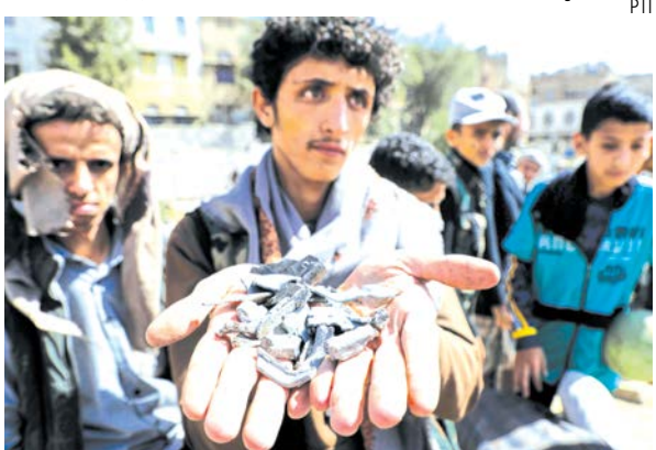
A Yemeni shows remains of one of the shells from a location reportedly struck by US airstrikes in Sanaa, Yemen

AP, CAIRO: AP, Yemen's Houthi rebels said Saturday that the US military launched a series of airstrikes on the capital, Sanaa, and the Houthi-held coastal city of Hodeida, less than two days after a US strike wrecked a Red Sea port and killed more than 70 people. The office also reported US strikes in the capital, Sanaa. There were no immediate reports of casualties.