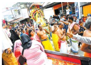
People look on as Indonesian ethnic Tamil Hindu devotees participate in the last day of the traditional 'Chithirai Mahapuja' procession in Banda Aceh