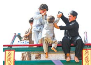
Afghan refugees help a child to climb on a truck at a makeshift camp upon their arrival from Pakistan near the Afghanistan-Pakistan