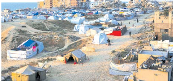
Palestinians displaced by the Israeli air and ground offensive on the Gaza Strip walk in a makeshift tent camp in Gaza City