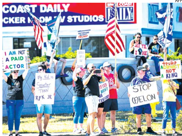
Demonstrators rally against Trump and join forces during a protest organized by the 50501 Movement in Cocoa, Florida

In Denver, hundreds of protesters gathered at the Colorado State Capitol with banners expressing solidarity with immigrants and telling the Trump administration: "Hands Off!" People waved US flags, some of them held upside down to