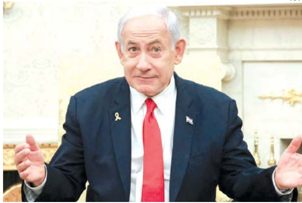
Israel has vowed to intensify attacks across Gaza and occupy indefinitely large 'security zones' inside the small coastal strip of over 2 million people. Hamas wants Israeli forces to withdraw from the territory. Israel also has blockaded Gaza for the past six weeks, again barring the entry of food and other goods.

The prime minister spoke after Israeli strikes killed more than 90 people in 48 hours, Gaza's Health Ministry said Saturday.