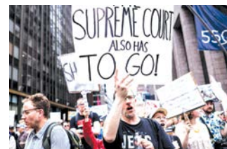
People hold up signs as they demonstrate during a rally titled 'Protect Migrants, Protect the Planet,' in New York City