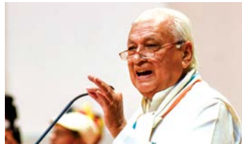
Bihar Governor Arif Mohammed Khan speaks during a programme, in Patna