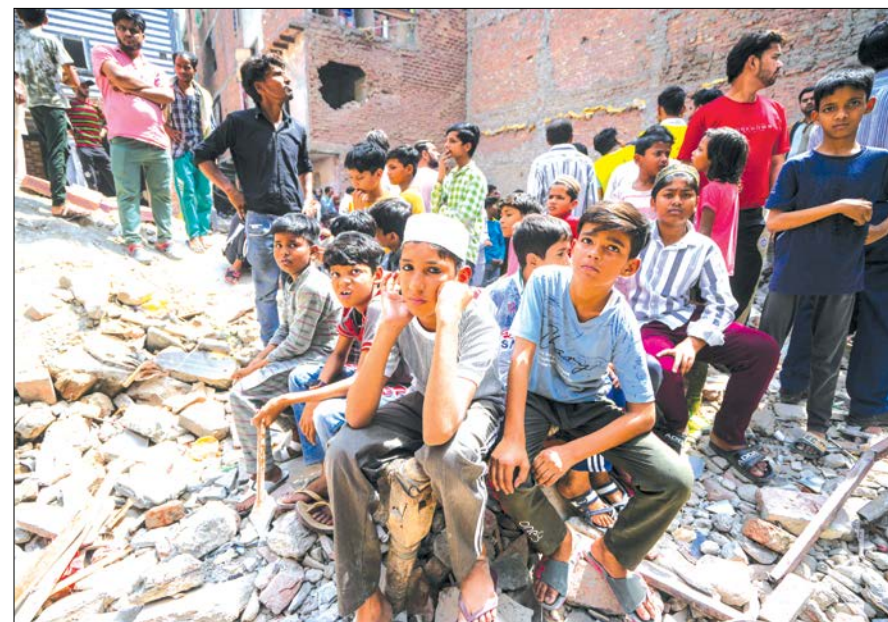
Children sit among the debris at the site, a day after a building collapsed in Mustafabad area of New Delhi, on Sunday

PTI, IMPHAL: A total of 16 members of several proscribed outfits have been arrested in the last 48 hours in Manipur, police said on Sunday. Two cadres of the banned United National Liberation Front (Pambei) were apprehended from Napetpalli Andro road near Nongdam village in Imphal East district on Saturday. They were allegedly involved in extortion, a senior officer said. Security forces arrested one member of the outlawed Kangleipak Communist Party (Taibanganba) from Ningthoukhong Ward No 13 in Bishnupur district on Friday, he said. Two cadres of the proscribed KCP (MFL) were apprehended on the same day from Salam Mamang Leikai Ketuki Lampak in Imphal West district, the officer said, adding that they were also allegedly involved in extortion. The state police arrested one cadre of the proscribed Prepak (PRO) from Kyamgei Heibong Makhong area in Imphal East district on Friday, he said. One cadre of the banned Kanglei Yawol Kanna Lup (KYKL) was taken into custody from the Imphal East district.