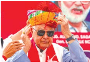
J&K National Conference President Farooq Abdullah during a party joining programme, at Marh, on the outskirts of Jammu