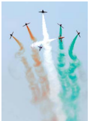
IAF's SKAT performs in Ranchi, Jharkhand, on Sunday

IAF's Surya Kiran pilots paint Ranchi sky with tri-colour RANCHI: The Indian Air Force's Surya Kiran Aerobatic Team (SKAT) painted the skies above the Namkum Army Ground in Ranchi with vibrant streaks of saffron, white and green, leaving thousands of spectators spellbound on the final day of an air show on Sunday. Minister of State for Defence Sanjay Seth, senior defence and administrative officials were present at the event. "People on the ground saluting the vibrant tri-colour in the sky was a spectacular moment. I salute the brave pilots of Surya Kiran for their outstanding exhibition," Seth said. He said that the air show was a milestone.