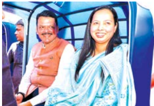
Maharashtra CM Devendra Fadnavis during distribution of Pink e-rickshaws to women beneficiaries at a ceremony, in Nagpur