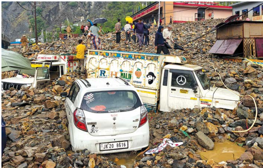
Vehicles stuck in the debris after heavy rain triggered flash floods in Ramban, J&K, on Sunday

lives in rain-related incidents in the Jammu region in two days. Two people, including a woman, were killed and another woman was injured when they were struck by lightning in the Arnas area of Reasi district late on Saturday. The officials said about 40 residential houses were damaged after a flash flood hit Dharam Kund village. Ten houses were fully damaged while the rest suffered partial damage. More than 100 trapped villagers were rescued by police personnel who rushed to the site despite the continuous downpour, they said. Several vehicles were swept away in the flood caused by an overflowing stream, officials said. "The situation is bad.. on my return I will submit my