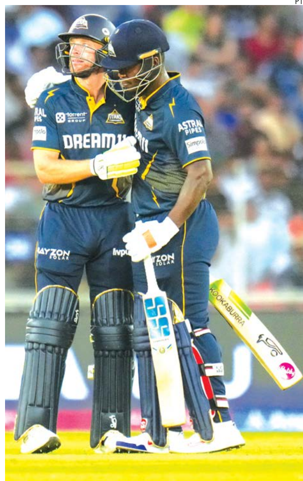
Gujarat Titans' batter Jos Buttler (left) being congratulated by teammate Sherfane Rutherford after his half century during the Indian Premier League match against Delhi Capitals, at Narendra Modi Stadium, in Ahmedabad, Gujarat, on Saturday