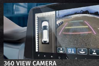
360 VIEW CAMERA