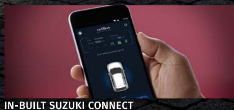
IN-BUILT SUZUKI CONNECT

3 years 100 000 km WARRANTY* EXTENDABLE UPTO 6 YEARS