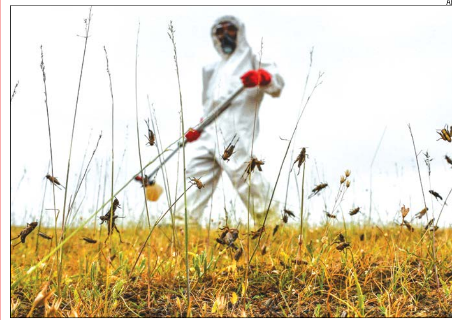
An Afghan agricultural department worker wearing protective gear sprays insecticide on locusts foraging on a hillside in Qeran village in Hazrati Sultan district of Samangan province