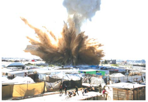
People run for cover as a plume of smoke rises above tents at a camp for displaced Palestinians in northern Khan Yunis in the southern Gaza Strip, during an Israeli strike

Four other people were killed in separate strikes in Rafah city, including a six weeks Israel also has