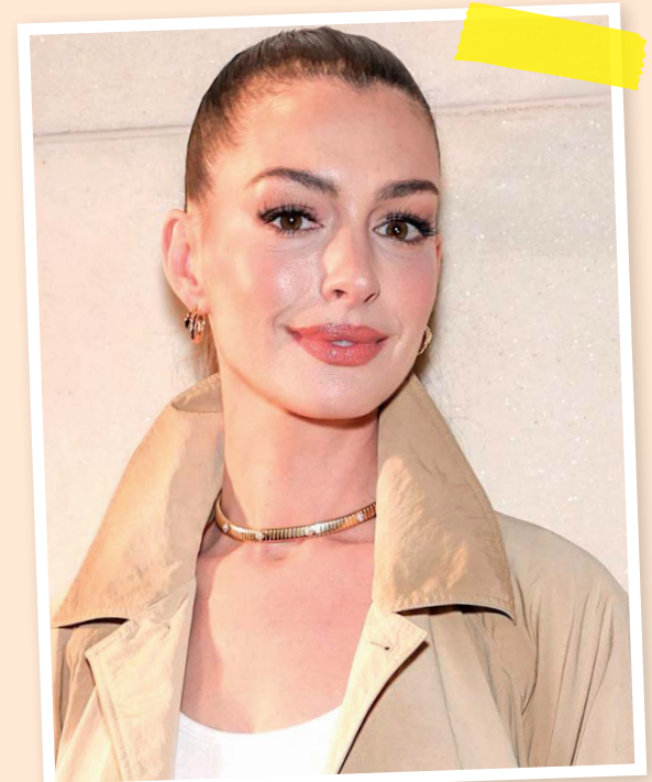
Anne Hathaway, 42, sparks plastic surgery speculation as she debuts a very taut face at Ralph Lauren fashion show