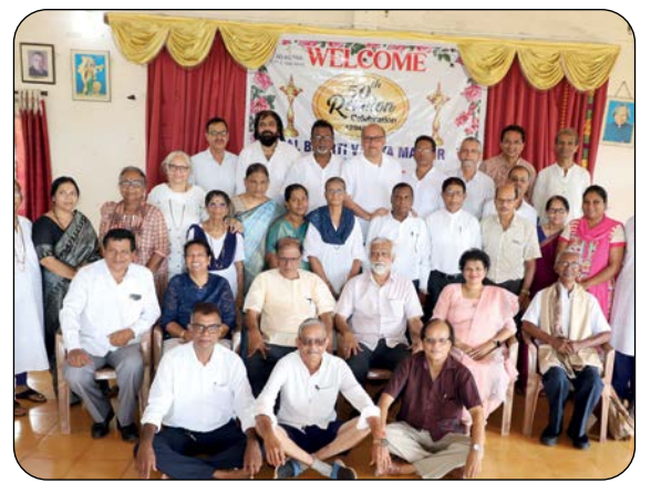
BBVM STUDENTS HOLD THEIR GOLDEN JUBILEE REUNION