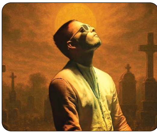
AIZ MHAKA FALEA TUKA: FIRST KONKANI HIP-HOP GOSPEL ALBUM