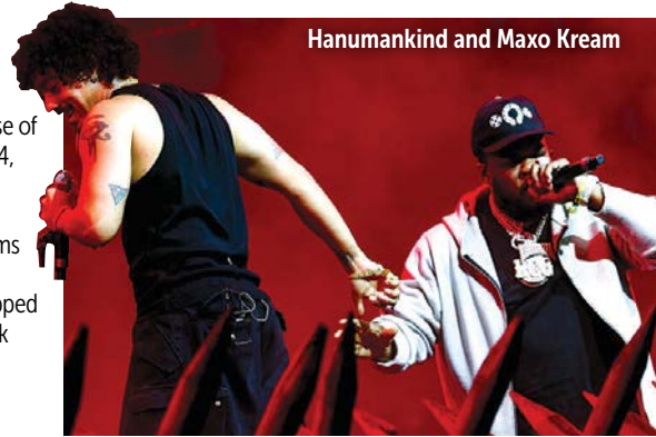
Hanumankind and Maxo Kream

Hanumankind, aka Sooraj Cherukat, became a global sensation after the release of his track 'Big Dawgs.' Released in July 2024, penned and performed by Hanumankind, it has amassed over 110 million views on YouTube worldwide and 197 million streams on Spotify. The track made it to Spotify's Global Top 50 also. This track not only topped globally but also briefly outpaced Kendrick Lamar's diss track 'Not like Us.' The song's popularity on TikTok, with over 1.4 million Reels, further amplified its reach.