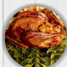
Roast & Stuffed TURKEY INDIAN