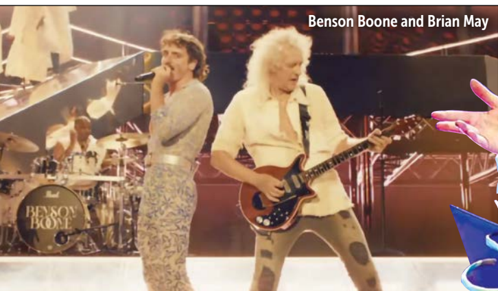
Benson Boone and Brian May