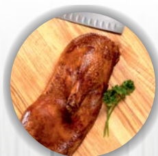
Roast US HALF DUCK