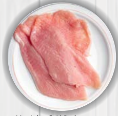
Healthy & Wholesome US TURKEY BREAST (Raw) #Complimentary - cooked to your taste

► Special Easter arrivals of Raw Belgium Pork , Cold Cuts, Italian Parma & Prosciutto Salsamis at Magsons Gogol and Taleigao.