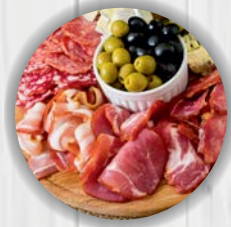
COLD CUTS PLATTER