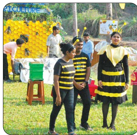
HONEY FEST PUTS SUSTAINABILITY IN THE SPOTLIGHT

Compared to last year, with Easter falling in mid-April, tiatr directors have a shorter window to book and stage their productions in both cities and villages. By the end of May, monsoon releases will likely be announced and performed exclusively in city auditoriums. As a result, many directors may opt for simpler productions, focusing less on elaborate stage sets and effects, and instead presenting basic scripts enriched with songs and comedy. However, newcomers are expected to put in greater effort on scriptwriting, direction, music, comedy, and technical aspects like stage design and lighting—hoping to impress organizers and audiences alike, and build demand for their future shows.