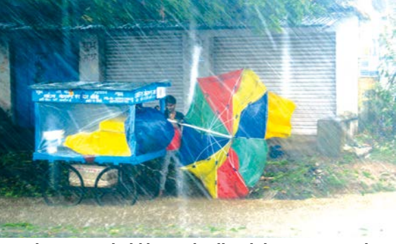
A vendor tries to hold his umbrella while getting caught in sudden rain, in Ranchi, Jharkhand

several areas, they said. Waterlogging was reported from several low-lying areas of Bhubaneswar and Cuttack, they said. More than 100 trees were uprooted in Cuttack's Banki area, blocking the road to