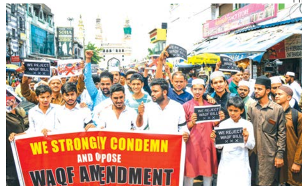
People take part in a protest against the Central Government over Wagf (Amendment) Act, 2025, near Charminar in Hyderabad

the Muslim community. The Muslim community has faced oppression in the past, but this time, through the amendment to the Waqf Act, there appears to be an underlying effort to diminish the importance of Waqf, he stated. He urged the community to uphold the nation's multicultural and democratic spirit while firmly assert-