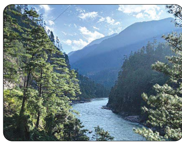
DONG VALLEY: WITNESSING THE FIRST SUNRISE OF INDIA

Maundy Thursday: More than a meal, a message of service