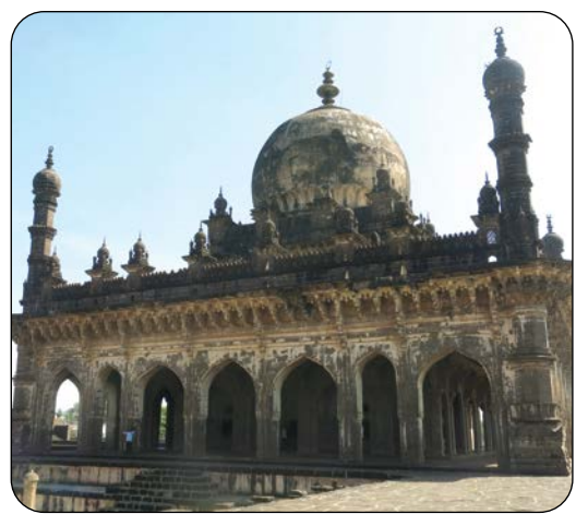
A DRIVE THROUGH HISTORY