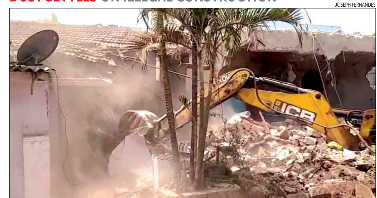
Illegal structures collectively called 'Lala ki Basti' on land belonging to the Comunidade of Thivim being demolished, on Tuesday