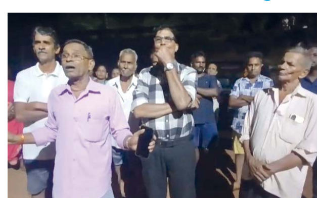
Villagers protest against the controversial National Highway expansion project in Bhoma

However, Bhoma residents were quick to counter the Minister's assertions. "We are not fools to be misled without concrete evidence," said one local leader, demanding documentary proof and a clear alignment plan. "Gaude claims he will protest in the future, but why didn't any MLA stand up when the Khapreshwar