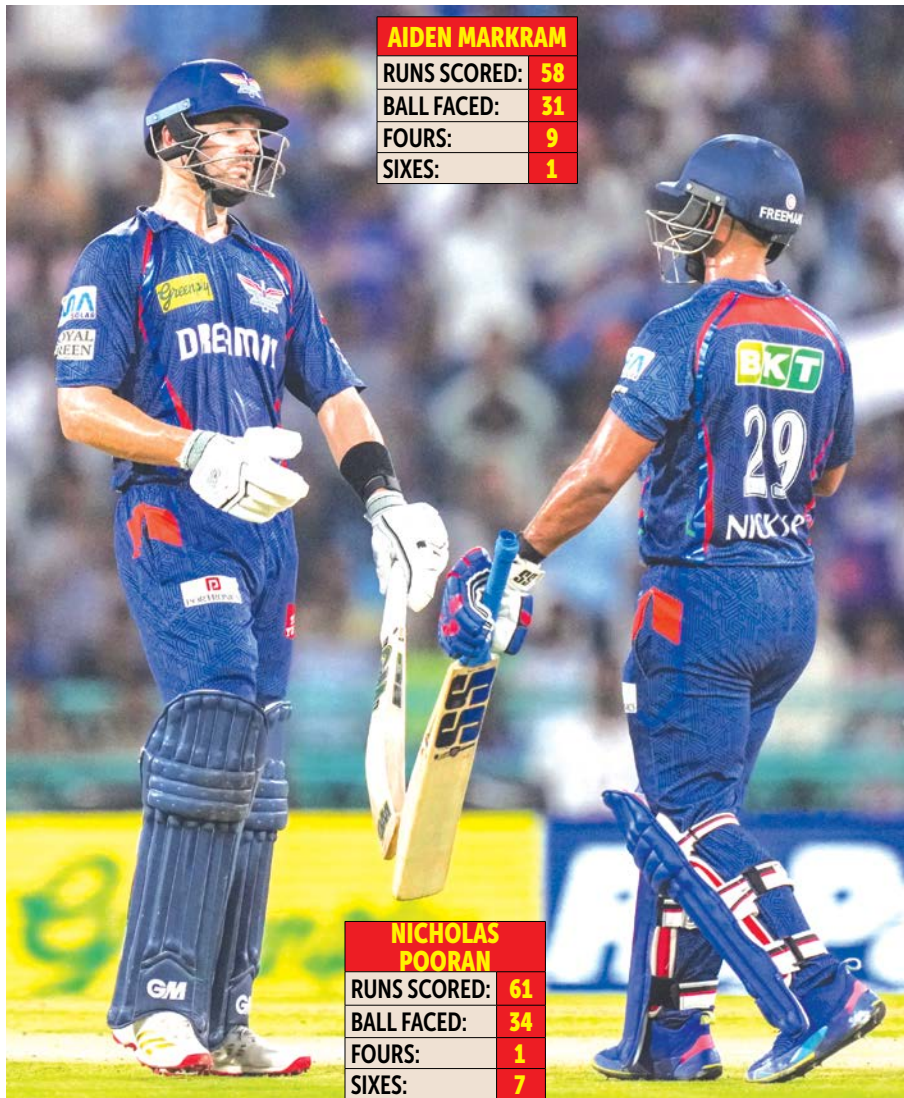
Lucknow Super Giants' Nicholas Pooran and Aiden Markram share a light moment during an Indian Premier League match against Gujarat Titans, at Bharat Ratna Shri Atal Bihari Vajpayee Ekana Cricket Stadium, in Lucknow, on Saturday