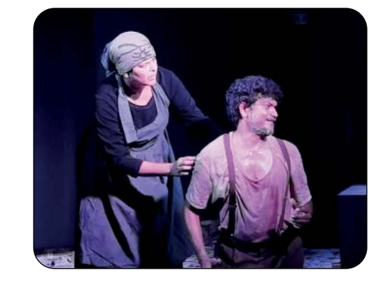
ATHOL FUGARD'S 'A PLACE WITH THE PIGS' CAPTIVATES AUDIENCES AT MAJORDA