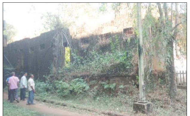
The dilapidated old building adjacent to the new school building. which parents want demolished to make space for a playground