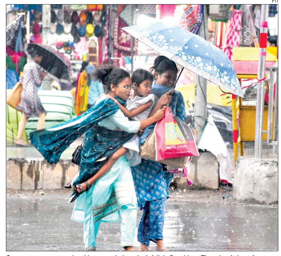
Commuters cross a road amid strong winds and rainfall, in Ranchi, on Thursday. At least four persons were injured in lightning strikes in Jharkhand, as rain accompanied with hailstorms lashed most parts of the state, officials said