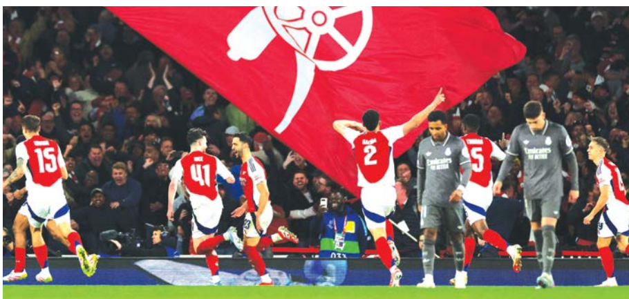
Arsenal midfielder Mikel Merino (centre right) celebrates scoring the team's third goal against Real Madrid, at the Emirates Stadium, in London