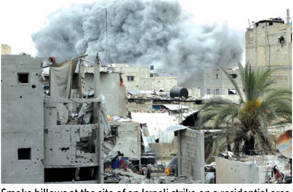
Smoke billows at the site of an Israeli strike on a residential area in Gaza City's Shujaiyya neighbourhood

The Israeli military said it struck a senior Hamas militant who it said was behind attacks emanating from Shijaiyah. It did not name him or provide further details. Israel blames the deaths of civilians on