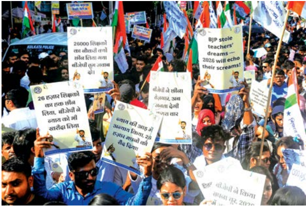
Members of Trinamool Congress Chhatra Parishad and others during a protest rally over loss of school jobs, at Shaheed Minar Maidan, in Kolkata

PTI, KOLKATA: Twenty-two people were arrested in connection with the violence in the Muslim-dominated Murshidabad district of West Bengal during a demonstration against the Waqf (Amendment) Act, police said on Wednesday. The situation has been peaceful with a huge contingent of police maintaining a strict vigil on the sensitive areas, especially in and around Jangipur, which was rocked by the violence on Tuesday, they said. "The situation is calm, peaceful and under control. Not a single untoward incident was reported from anywhere in the district. Prohibitory orders would continue to remain in force till 6 pm on April 10. Internet would also remain suspended till 6 pm on April 11," a senior police officer said. Prohibitory orders were clamped in and around Raghunathganj and Suti police station areas following the violence. Stones were hurled targeting the police, and vehicles of the force were set on fire by a mob that blocked