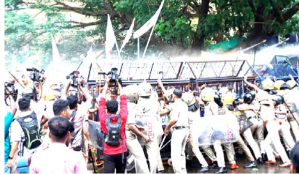
Police lathi-charge after protest march turns violent, in Kerala

PTI, KOZHIKODE (KERALA): Tension prevailed near Karipur International Airport here for a while on Wednesday after a protest march by an Islamist outfit against the Waqf Bill turned violent. The incident occurred during a march organised by activists of the Solidarity Youth Movement and the Students Islamic Organisation (SIO), both affiliated with Jamaat-e-Islami. The protesters were demanding the scrapping of the recently passed Bill, police said. Barricades were set up by the police to prevent the protesters from advancing. When the protesters attempted to break through despite warnings, police resorted to a lathicharge and used water cannons multiple times to disperse the crowd.