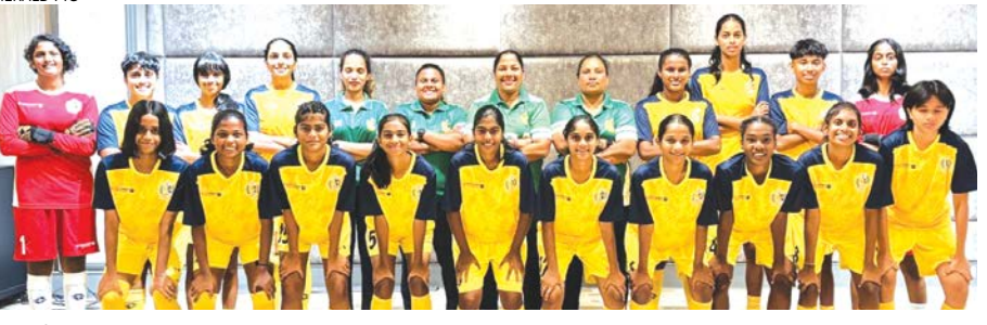
The Goa Football Association team, which will kick off their campaign against Jharkhand Football Association on Wednesday, at SAG ground, Utorda, at 8.30 am

On Tuesday evening, Punjab will play Sesa Football Academy at the SAG ground, Benaulim and Norwich City FC will play Football 4 Change at the SAG ground, Utorda.