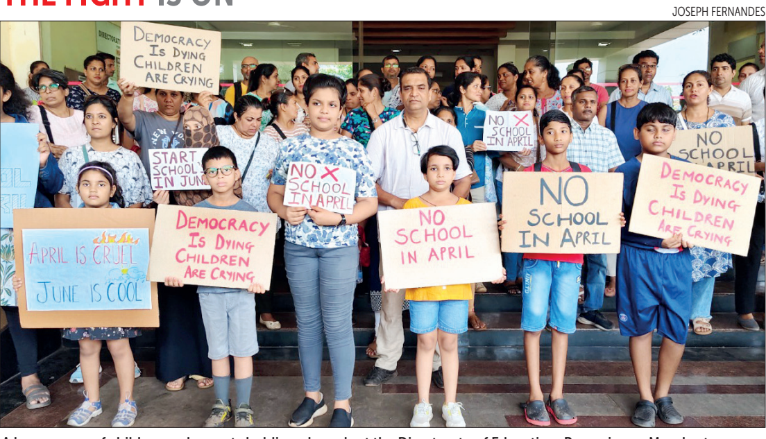
A large group of children and parents holding placards at the Directorate of Education, Porvorim on Monday to protest against the commencement of the academic year in the peak summer month of April. The parent's contention is that their objections are not being heard. They asserted that they are not against NEP, but its poor implementation is detrimental to the student's future Report on PAGE 3 >>