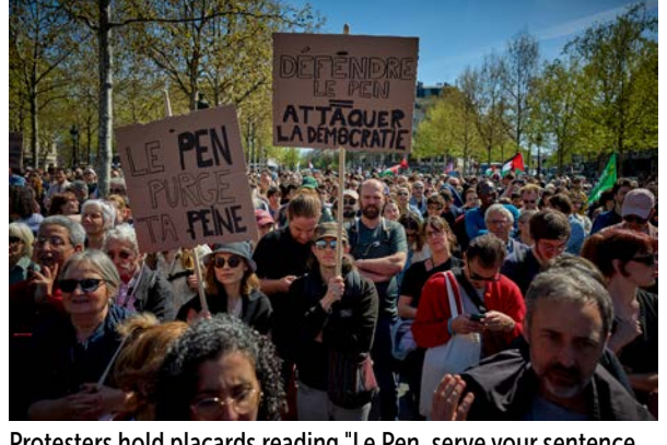
Protesters hold placards reading "Le Pen, serve your sentence in prison" (L) and "defending Le Pen = attacking democracy" during a rally against the far-right, organised by French leftist party La France Insoumise (LFI) and Les Ecologistes (Ecologists party) at the Place de la Republique in Paris

The National Rally, Le Pen's party, organised the event in response to what it calls a politically motivated verdict. But with chants of 'Marine Présidente!" and "They won't steal 2027 from us," the message was clear: this was more than a protest. It was a show of populist defiance aimed