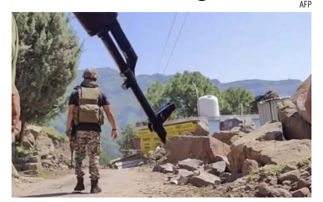
Security forces at the Pakistan-Afghanistan border keep vigil over terror activities

stan's Security forces of Pakistan killed eight terrorists and injured four others as they thwarted an infiltration attempt on the Pakistan-Afghanistan border in Pakhtunkhwa's North Waziristan district, the military's media affairs wing said on Sunday. Pakistan has witnessed an uptick in terror activities over the past year, especially in Khyber Pakhtunkhwa and Balochistan, after the proscribed Tehreek-i-Taliban Pakistan (TTP) ended its ceasefire with the government in November 2022. On the intervening night of April 5-6, the "movement of a group of khwarij, trying to infiltrate through Pakistan-Afghanistan border, was picked up by the security forces in general area" of North Waziristan's