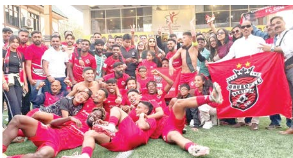
Churchill Brothers players celebrate after their match against Real Kashmir FC at the TRC football stadium in Srinagar, on Sunday

Title fate rests on AIFF verdict on April 28