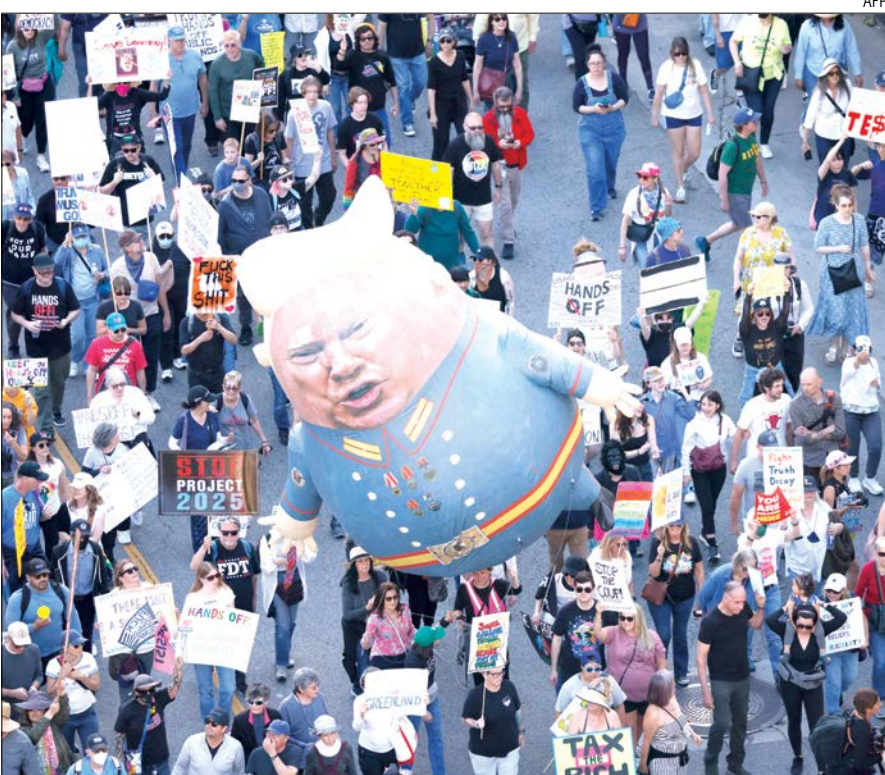
Protestors hold signs during a "Hands Off!" protest against the policies of US President Donald Trump and his advisor, Tesla CEO Elon Musk, in Huntington Beach, California