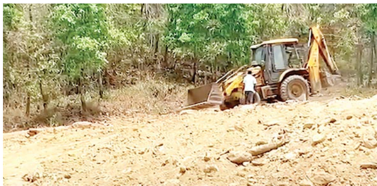
"Unauthorised" hill cutting and land filling activities underway in Sirvoi-Quepem

He further pointed out that the some government departments have not provided technical clear-