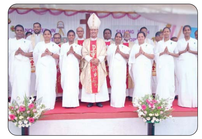
PERPETUAL PROFESSION OF THE SISTERS OF THE HELPERS OF MARY IN GOA