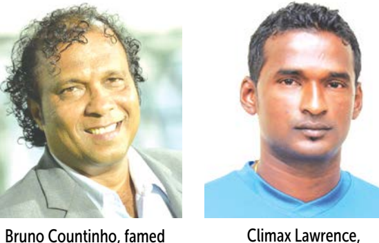
famed mid-fielder of the past

goal they scored in the last match showed it was a gift from God and they will take that form into the final match.