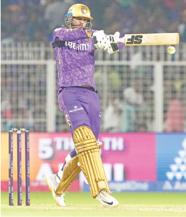
Kolkata Knight Riders' Venkatesh Iyer plays a shot during an Indian Premier League match against Sunrisers Hyderabad, at the Eden Gardens in Kolkata, on Thursday

Harshit Rana dismissed Abhishek Sharma (2), leaving SRH reeling at 9/3 in 2.1 overs, while Andre Russell and Sunil Narine also chipped in with a wicket each to make it 66/5 inside 10 overs. Varun Chakravathy then cleaned up the lower order taking two wickets in two balls en route to his