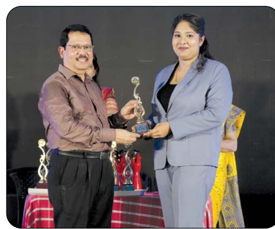
STUDENTS FUSE STYLE AND SUBSTANCE AT SUSHEGAD SHOW

The video was also shared by the official account of Tesla. "Schedule your light show on multiple vehicles simultaneously to create an epic festival of lights," the company tweeted.