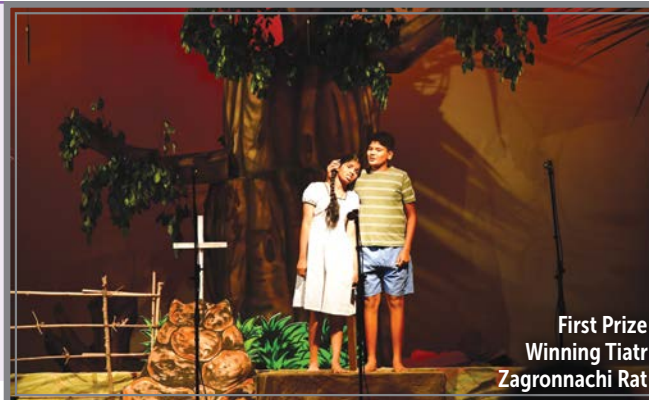
First Prize Winning Tiatr Zagronnachi Rat