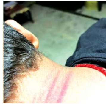
The student reportedly suffered severe neck injuries

PANJIM: The Education Department suspended a physical education teacher from a reputed high school in Curchorem for allegedly assaulting a minor student from Class 9 for creating ruckus in the classroom. The student reportedly suffered severe neck injuries.