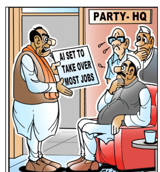
Let's save our jobs first, then the others.