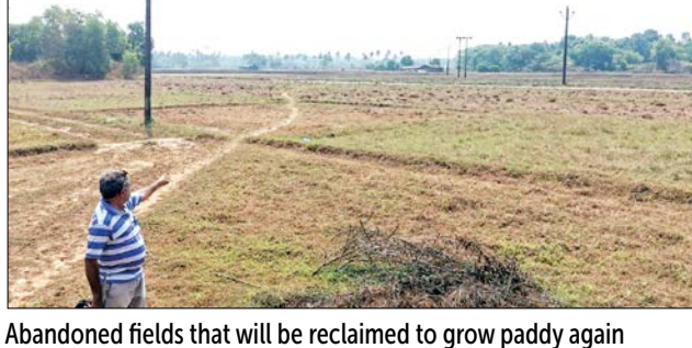
Abandoned fields that will be reclaimed to grow paddy again

Historically, Comunidades have been known for their agricultural practices and land management, making this initiative a fitting way to preserve this centuries-old legacy while addressing contemporary challenges of food