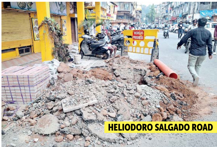
HELIODORO SALGADO ROAD

An O Herald inspection showed that stretches such as SV Road, from Geeta Bakery to DB Road Junction, the