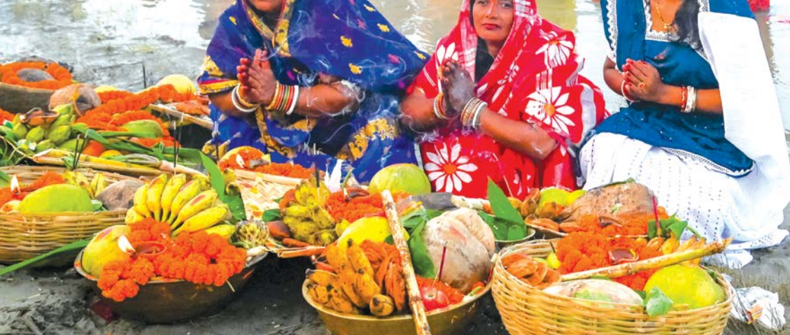
Women perform rituals during 'Chaiti chhath puja' festival, on the banks of the Hooghly river in Nadia, West Bengal

Police broke open the lock of the collapsible gate of the flat and found her boyfriend in one room and the woman's body in another room, he added.