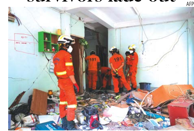
Myanmar's rescuers work through rubble of a collapsed building following Friday's earthquake in Naypyitaw, Myanmar

Death toll 2,700 even as hopes of finding survivors fade out