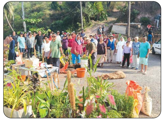
LENTEN RETREATANTS LOOK FOR 'GOD IN CREATION' AT BAGA