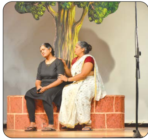
JUSTICE AWAITS EVERYONE