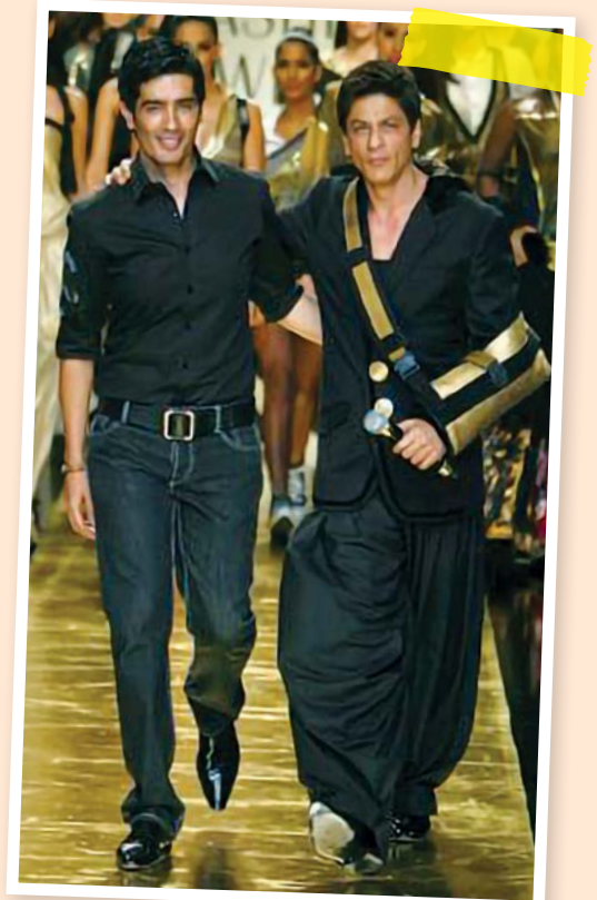
Manish Malhotra gave a glimpse of an arm sling at the grand finale of 25 years of Lakme Fashion Week XFDCl that he made for Shah Rukh Khan, years back.