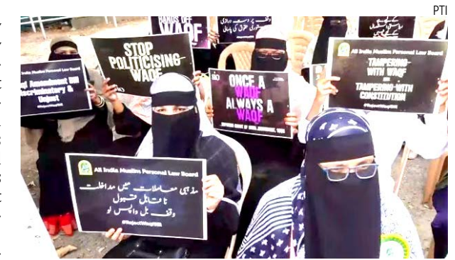
The Waqf Amendment Bill is expected to be re-introduced during the ongoing session of Parliament

Opposition parties are strongly opposed to the bill, slamming it as unconstitu-