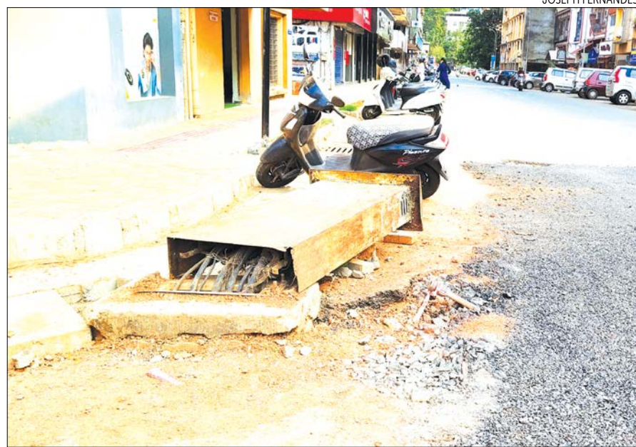
A telephone junction box lies unattended on MG Road, Panjim, posing a hazard to pedestrians and motorists